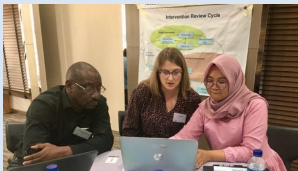
Participants working on a case assignment, November 2019

The event will combine training sessions on good practices and successful examples of assessing system change with workshop sessions where the field is still searching for practical approaches, particularly assessing complex dimensions of system change.