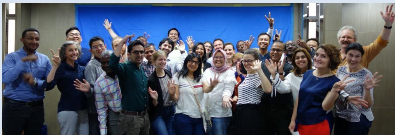
2019 Advanced RM Training Workshop Group

To attend this training workshop, you must have at least 2 years of practical experience applying the DCED Results Measurement Standard.