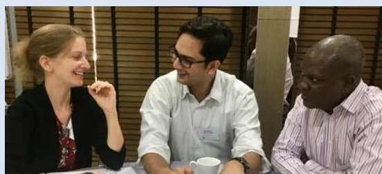
Participants tackled challenges in groups at the 2019 Advanced RM Training Workshop

This unique training workshop will bring together experienced results measurement practitioners to share lessons learned, solve common problems, exchange practical approaches to address identified challenges and build a supportive network. Participants will become more capable and confident to lead results measurement in organizations that aim to catalyse system change across the world.