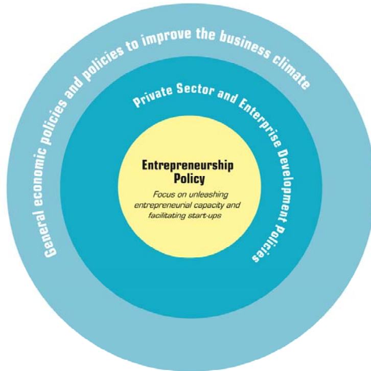
Figure 1. The focus of the Entrepreneurship Policy Framework